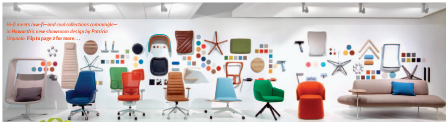
Hi-fi meets low-fi—and cool collections commingle—in Haworth's new showroom design by Patricia Urquiola. Flip to page 2 for more...