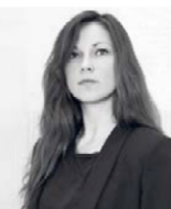
Mae Engelgeer for Wolf-Gordon

product Cozy standout Wool and polyester combine in plush woven wall coverings, alternately playful and sophisticated—and sound-absorbent to boot. mayaromanoff.com. circle 352