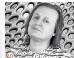
Mac Stopa for A.S. Création

product Balance standout At once irregular and symmetrical, repetitive geometries of varying scale are digitally printed on Mylar wall coverings reminiscent of Dutch modernism. wolfgordon.com. circle 353