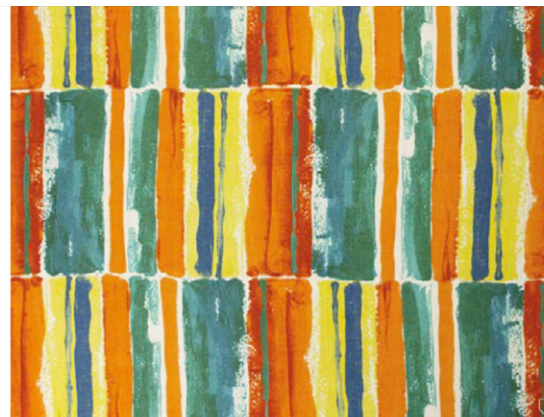
FABRIC & WALL covering